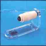
- Toe jig 80071