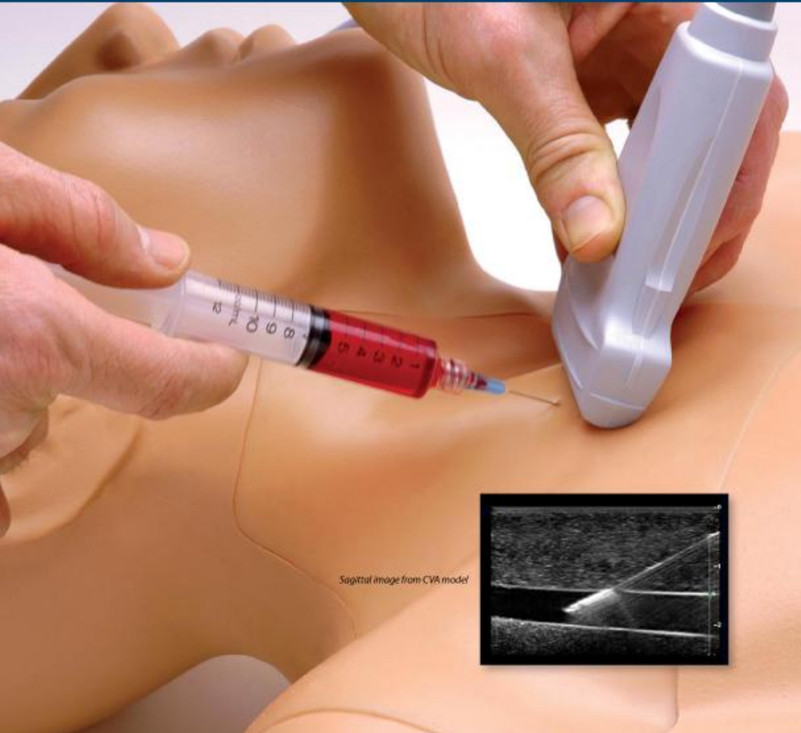
Sagittal image from CVA model