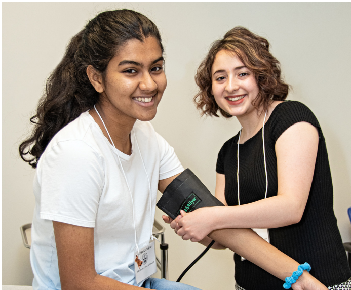
High school students at the Health Careers Institute check each other's blood pressure as part of the five-day event.

Attendees participated in 40 hours of workshops, labs, and interactive activities during the event, which was held for five days from 8:00 AM until 4:00 PM each day. Forty-eight high schoolers from 32 schools – including three out-of-state schools – were selected for the program, including 40 juniors and eight seniors.